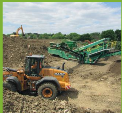
Static product recovery at our Havant Recycling facility.