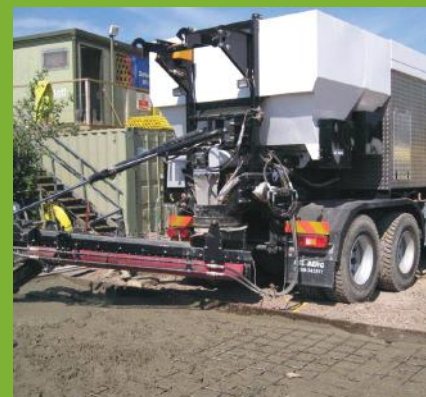
Large scale spoil regeneration on site or at one of our static sites.