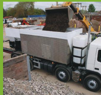
The stabilised material is tested in UKAS laboratories and out-performs traditionally sourced aggregates.